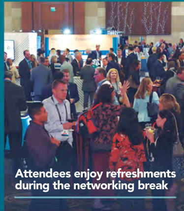
Attendees enjoy refreshments during the networking break

LYDIA CACHO INVESTIGATIVE JOURNALIST AND AUTHOR